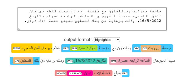
Figure 4: Web user interface of the nested named entities.

A RESTful web service for Arabic NER is developed and deployed online<sup>4</sup> as part of our language understanding resources (Jarrar and Amayreh, 2019; Al-Hajj and Jarrar, 2021b; Jarrar et al., 2019; Jarrar et al., 2021). The web service takes a text as input and returns the output in three different formats: ( i ) JSON IOB2, a JSON in which each token in the input text is returned with its corresponding tag similar to the IOB2 scheme, ( ii ) JSON entities, only the recognized named entities and their positions are returned, and ( iii ) XML, which is similar to the format ( ii ), but the named entities are marked up using XML. Additionally, as Figure 4 illustrates, a user interface is developed on top the web service for demonstration purposes, in which nested named entities are highlighted.